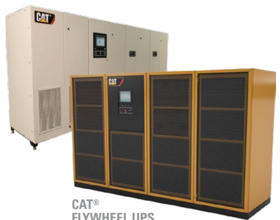
CAT® FLYWHEEL UPS

Provides continuous power even when power disturbances are likely.